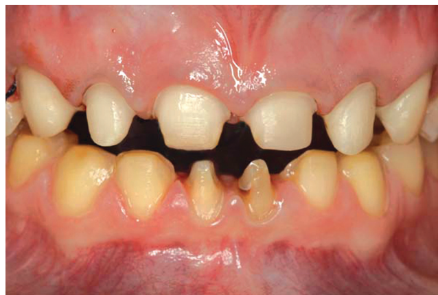
Figure 9. Maxillary tooth preparations with slightly concave shoulder margins and smooth contours, avoiding sharp angles. Mandibular right first premolar, canines, and lateral incisors were prepared with narrow chamfer finish lines.

Porcelain veneers were selected to restore tooth structural integrity, stiffness, and original biomechanical behavior. 13-15 A narrow shoulder preparation design 16 with incisal and interproximal wraparound was used for the maxillary anterior teeth. 17 This preparation design allowed the ceramist to design definitive restorations with optimal form and emergence profile. The preparation design for the mandibular right first premolar, canines, and lateral incisors, with a narrow chamfer finish line, followed the Type II indication for ceramic restorations as described by Magne and Belser 17 (Fig. 9). Definitive impressions were made by using a custom tray with the 1-step, double mix impression technique with a