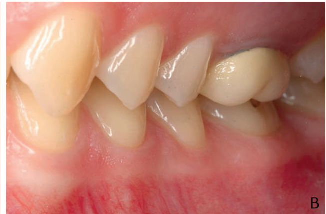
Figure 3. A, Pretreatment lateral views show malocclusion in maxillary right second molar. B, Maxillary left first molar shows pretreatment metal ceramic restoration.