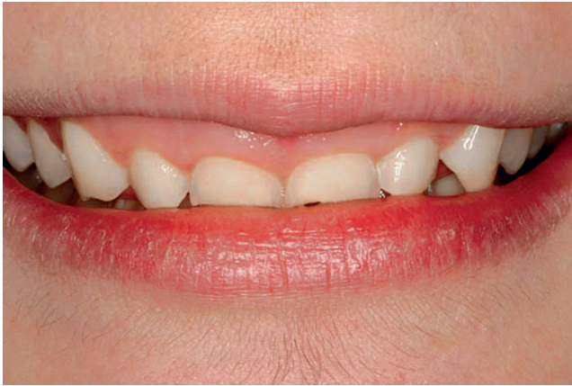
Figure 1. Esthetic analysis shows normal tooth exposure at rest and flat maxillary incisal plane both at rest and during smile. Excessive gingival display is apparent during smile.