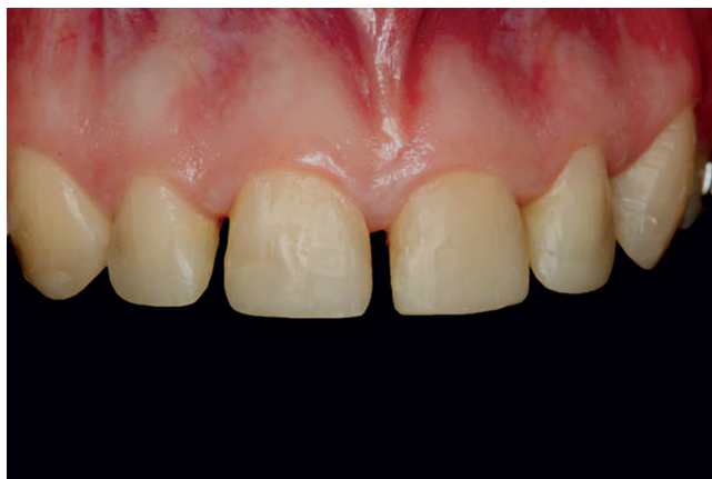
Figure 6. Interim restoration of maxillary anterior teeth with microhybrid composite resin to evaluate esthetics, phonetics, and occlusal stability.