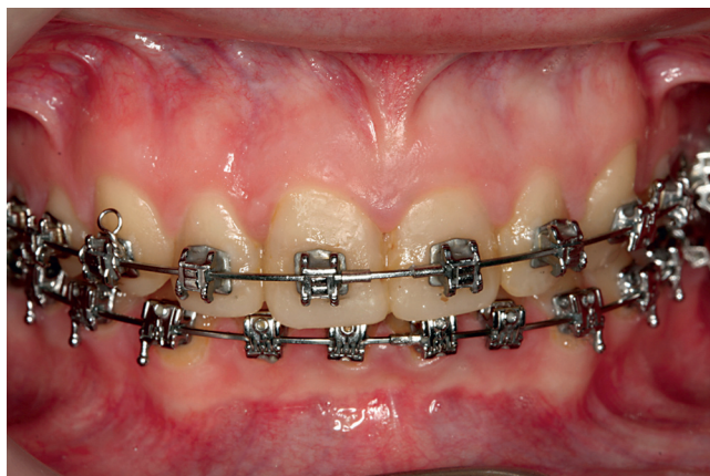
Figure 8. Composite resin was added again to maxillary canines and central and lateral incisors to restore them to anatomic contour, allowing orthodontic movement to be completed.

margins 1 mm more coronal after the intrusive movement was completed. In addition, composite resin was added only to the cingulums of the maxillary central and lateral incisors to increase the occlusal vertical dimension (OVD), generating interocclusal space between the posterior teeth and unlocking the occlusion in lateral segments.