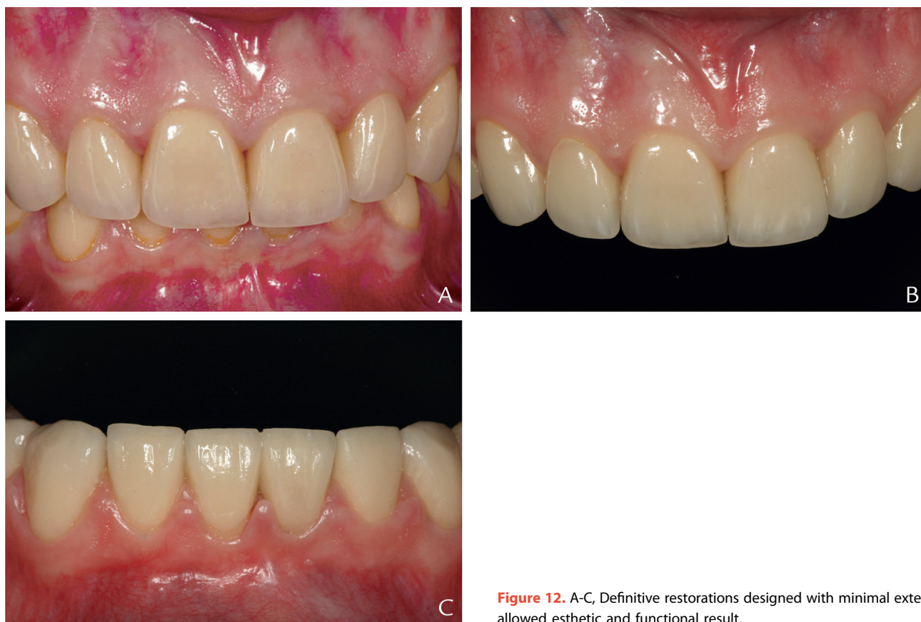
Figure 12. A-C, Definitive restorations designed with minimal extension allowed esthetic and functional result.

patient. Additionally, the occlusal scheme characterized by Angle class II, division 2 malocclusions could have exacerbated anterior tooth wear.