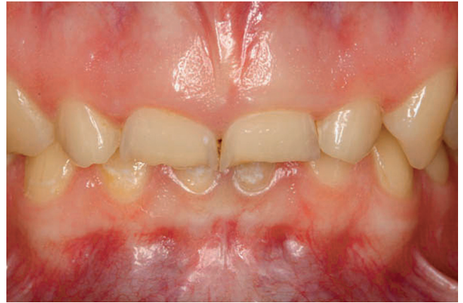
Figure 2. Width/length proportion of maxillary anterior teeth was severely altered by wear. Maxillary central and lateral incisors gingival levels show discrepancy with respect to maxillary canines.