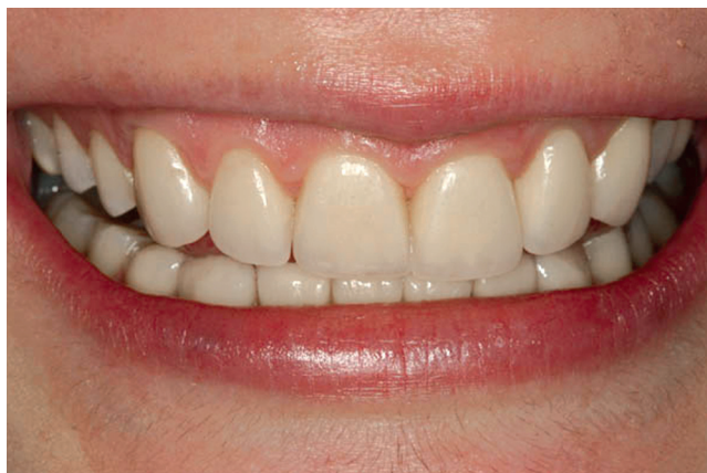
Figure 13. Completed restorations.

jeopardize the esthetic results but actually established a stable occlusion and a functional anterior guidance.