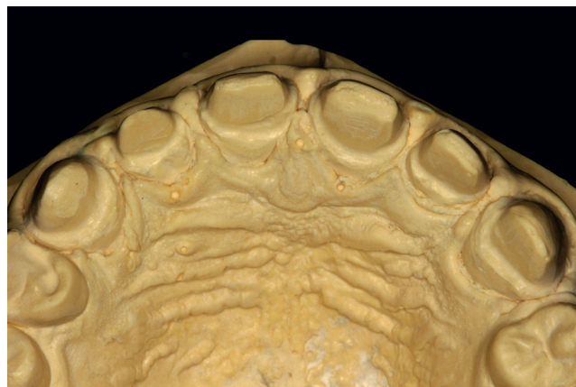
Figure 10. Occlusal views of tooth preparations show adequate occlusal and interproximal reduction for fabrication of definitive restorations.

vinyl-polyether silicone impression material (EXA'lence 370; GC Corp) 18 and a double cord (Ultrapak; Ultradent Products Inc) tissue displacement technique. 19 Definitive casts were fabricated with an improved Type IV dental stone and mounted in a semiadjustable articulator by means of new facebow and interocclusal records (Fig. 10).