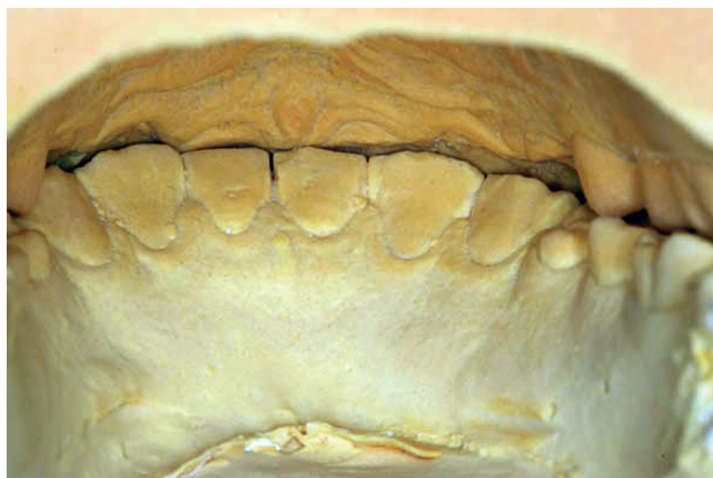
Figure 4. Lingual view of pretreatment study casts show absence of adequate interocclusal restorative space between maxillary and mandibular anterior teeth.