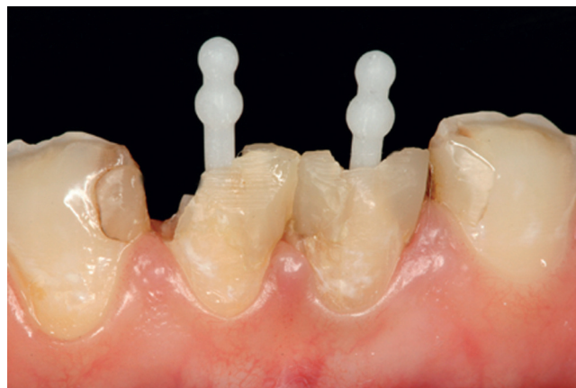
Figure 7. Mandibular central incisors retreated endodontically and restored with fiber/resin posts and direct composite resin restorations.

articulator displayed the absence of adequate inter-occlusal restorative space between the maxillary and mandibular anterior teeth (Fig. 4). The determination of the ideal treatment option was based on several criteria: tooth and gingival exposure at rest and during smiling, position of the incisal edge relative to the lower lip, tooth size and proportion, root shape and length, periodontal support, and preservation and/or reestablishment of the anterior guidance. The objectives of the treatment were to establish the proper tooth position and inclination with canine Angle class I occlusion, correct malocclusion of the maxillary right second molar, intrusion of the maxillary central and lateral incisors to recreate adequate restorative interocclusal space, and the apical repositioning of the gingival margin of the same teeth to improve gingival esthetics.