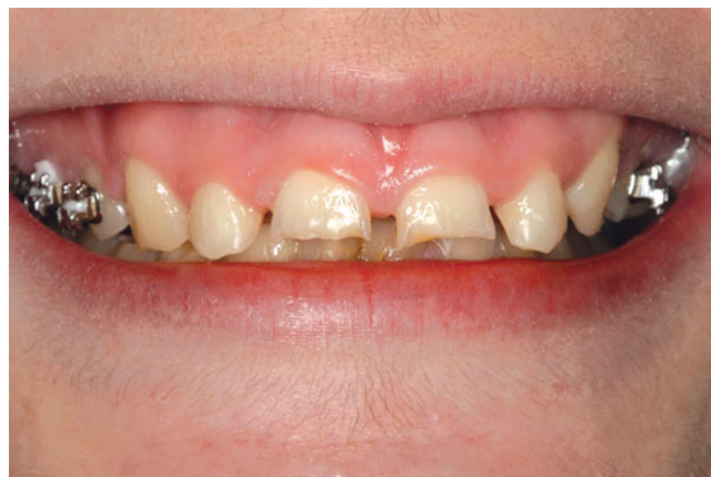
Figure 5. Diastemas and slight protrusion of maxillary anterior teeth were obtained with orthodontics to facilitate initial restorative procedures.